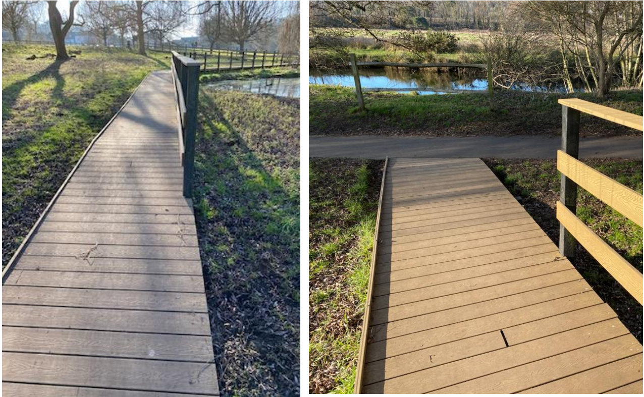
(Example of sustainable composite decking at Godalming, Surrey)

The work was planned to be carried out in quarter 4 of this financial year after the completion of another major path infrastructure project completed in Quarter 3 in Iver. The very wet and cold weather in January hampered the start of this activity.